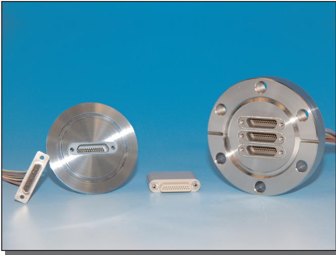
Complete air-to-vacuum instrumentation connectivity